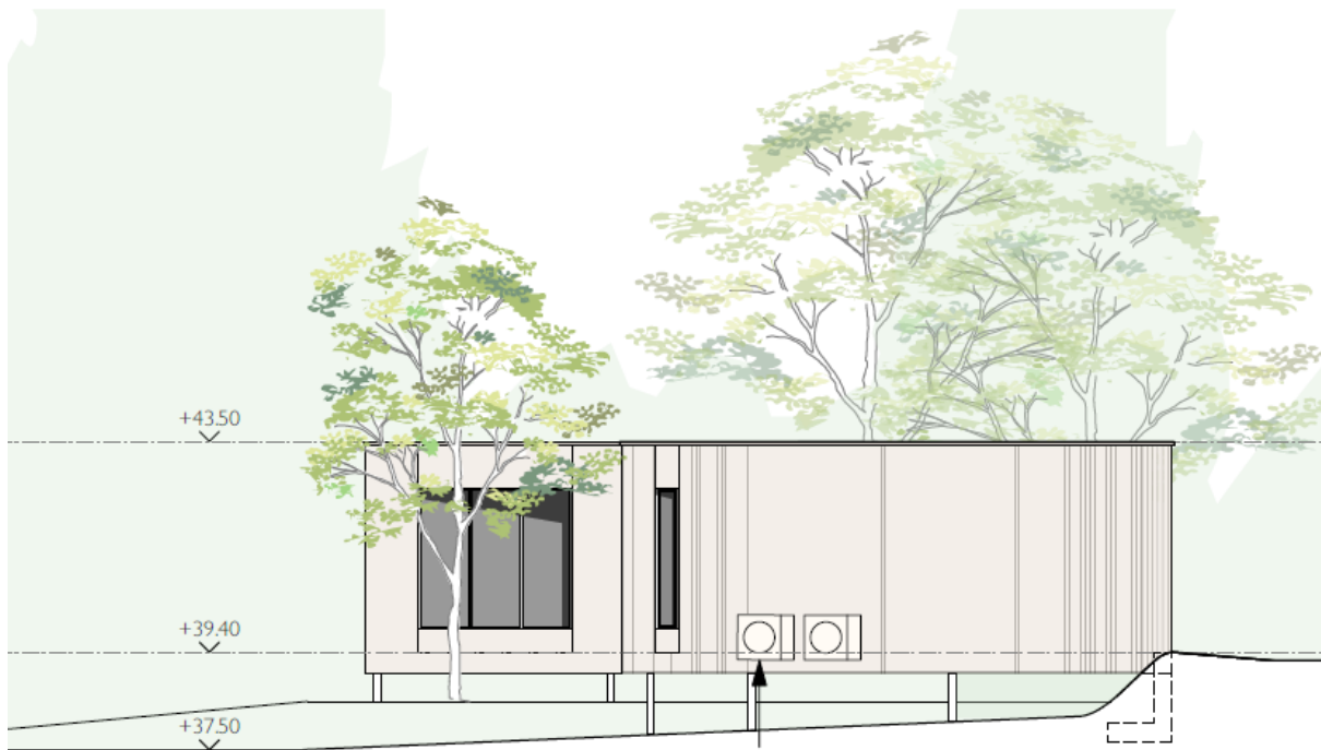
EAST ELEVATION - SCALE 1:100

2no wall mounted Air Source Heat Pump Units 1100h x 870w x 460d