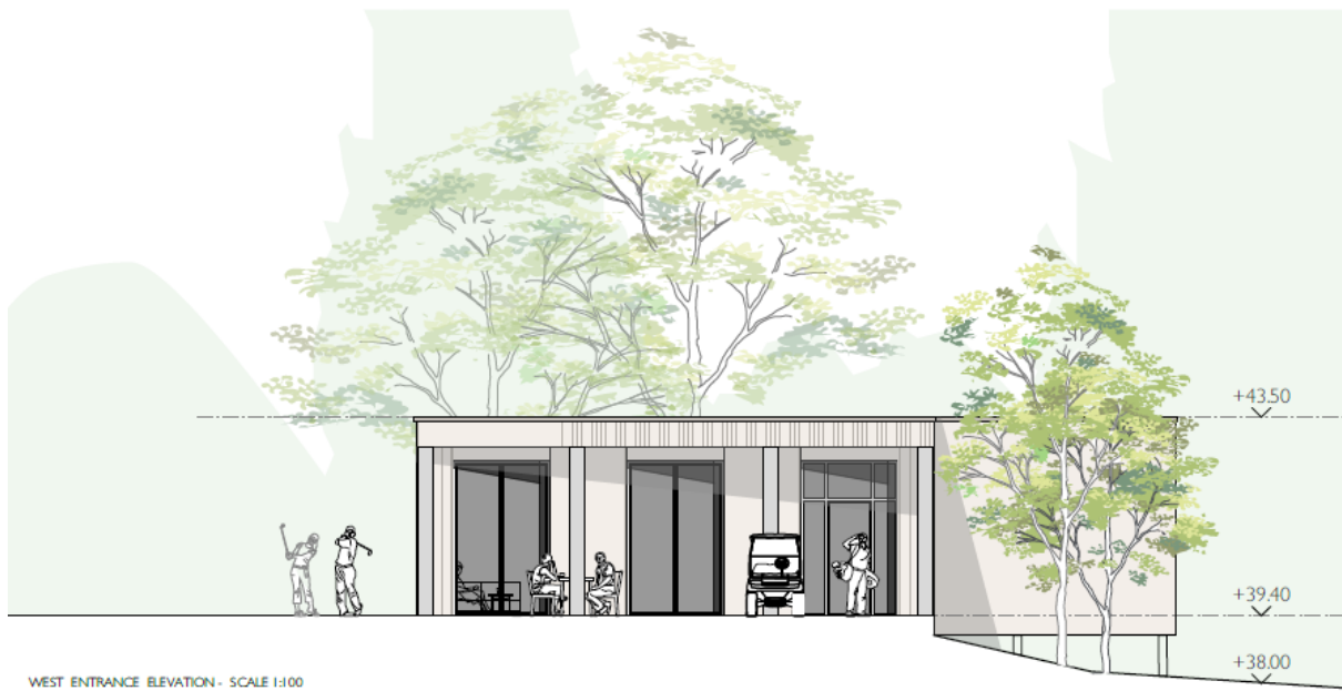
WEST ENTRANCE ELEVATION - SCALE 1:100